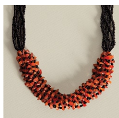
Chips Necklace (Amber) H094161 • $19.99

Your purchase of these items from WorldCrafts allows for the expansion of Higher Ground's work among the sexually exploited in Nepal. As WorldCrafts orders additional jewelry, Higher Ground can employ more women on the path to freedom. For a free catalog, call 1-800-968-7301. Join WorldCrafts on Facebook!