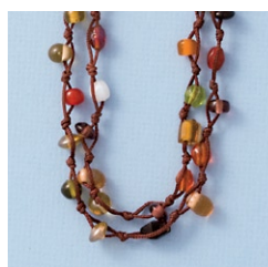
Knots and Nibits Necklace H094114 • $19.99