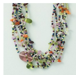
Spring Chameleon Necklace H094117 • $19.99